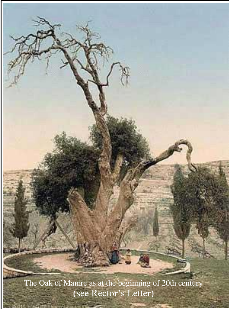
The Oak of Mamre as at the beginning of 20th century (see Rector's Letter)

Church News and Views for the Parishes of Badingham Bruisyard Cransford Dennington Rendham & Sweffling